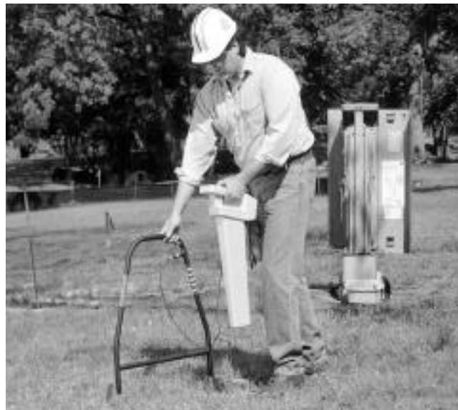
The Dynatel 2273 Cable/Fault Locator locates sheath (earth return) faults.

The 2273 cable/fault locator can precisely locate sheath (earth return) faults on both short and long cable sections. The unit sends a trace signal simultaneously with a fault-locate signal, allowing the operator to use the cable-locate function when locating sheath faults in long cable sections. Sheath (earth return) fault strength is indicated on the receiver LCD display, allowing minor faults to be ignored, if desired.