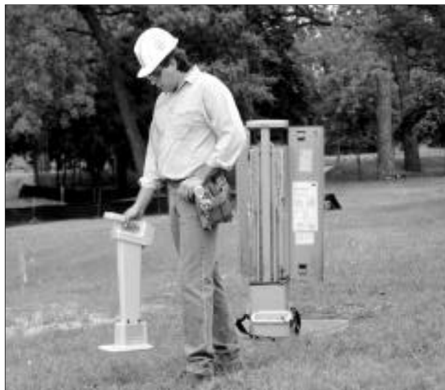
The Dynatel 2273 Cable/Fault Locator can be used with the Dynatel 2205/2206 EMS Marker Locating Accessory.