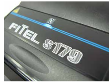
NFC: LOCK AND UNLOCK