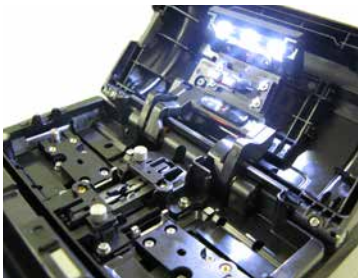
ILLUMINATION LAMP: 3+ 1 LED LIGHTS