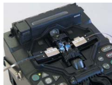
Top view of FSM-50R12