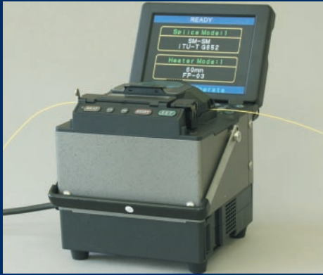
FMS-50S with monitor in Top position