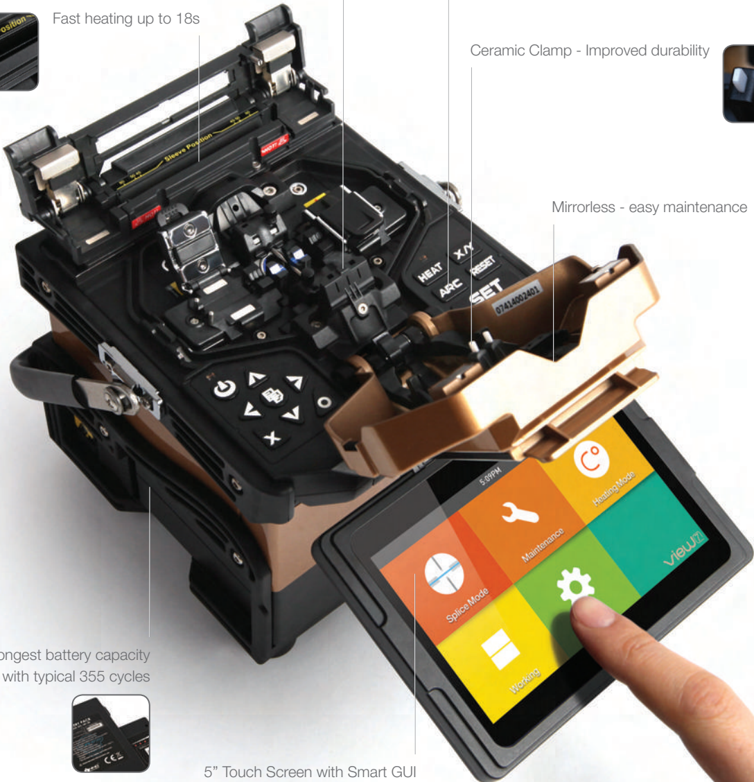
Longest battery capacity with typical 355 cycles