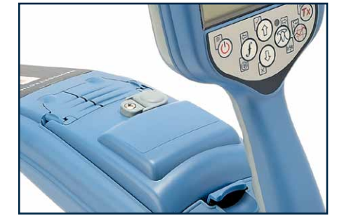
Li-lon battery pack

Lithium-Ion rechargeable battery options for both locator and transmitter provide extended runtime with reduced running costs.