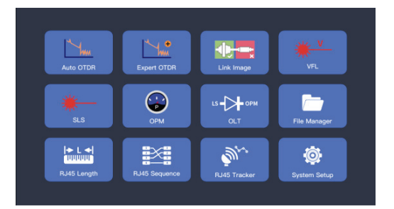
Main Menu of BASIC models